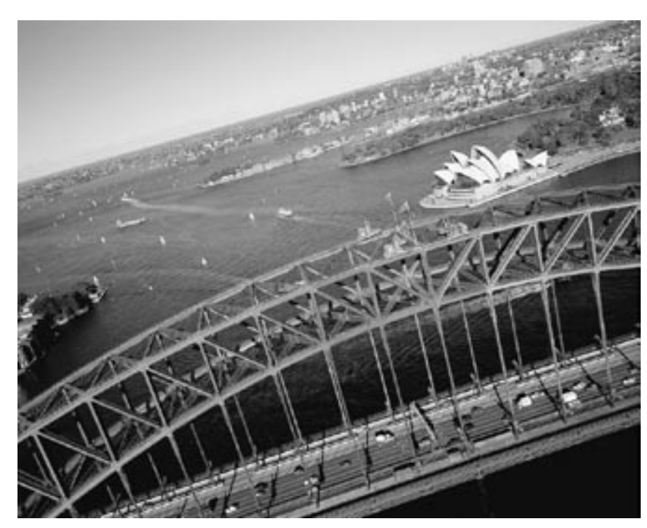
ISI 2005 Sydney, Australia 5-12 April 2005 – Come and see Sydney, an exciting and cosmopolitan city located on one of the largest and most beautiful harbours in the world.

* Optional events are not included in the registration fee.