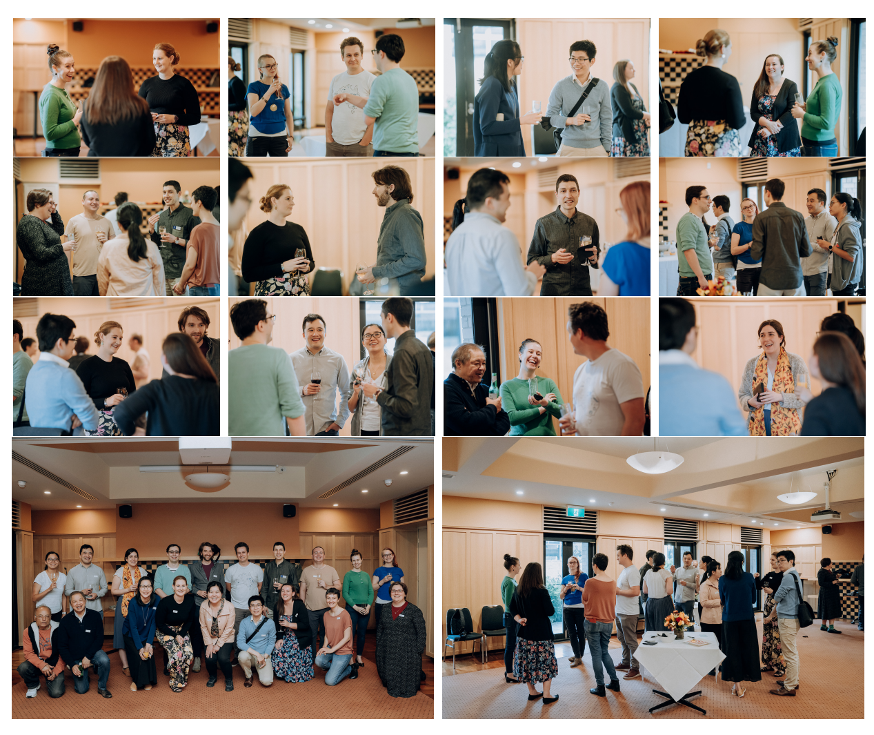
End-of-year social event