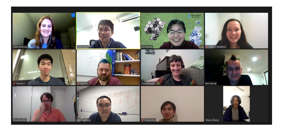
Online trivia with some interstate participants.