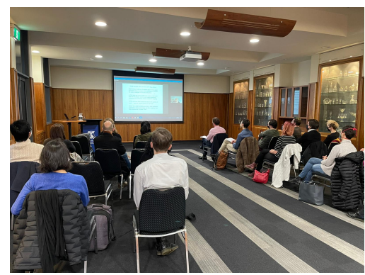
ANZSC Face-to-Face Victoria Hub and Foreman Lecture