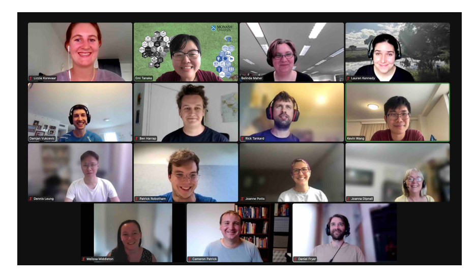
Last council meeting with guest observers.

I also thank our Council members, whose enthusiastic engagement and tireless efforts have helped to deliver diverse events to our community, but also their willingness to adapt to new technology and contribute in many aspects that support our community.